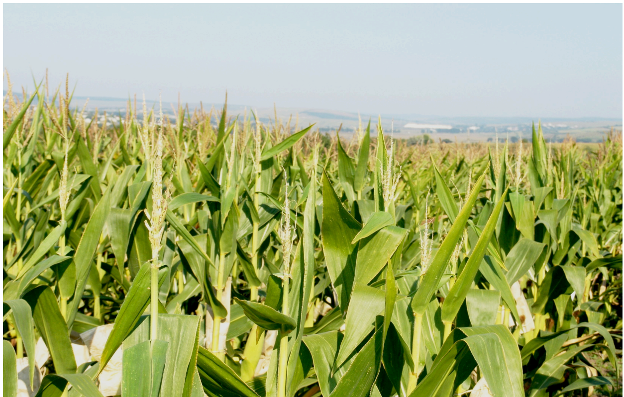
Figure 2. Tasselless mutation (Source HM 77)